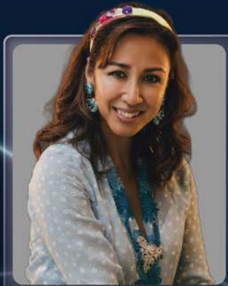
Y.A.M TENGGU DATIN PADUKA SETIA ZATASHAH SULTAN SHARAFUDDIN IDRIS SHAH Chairperson Board of Trustees